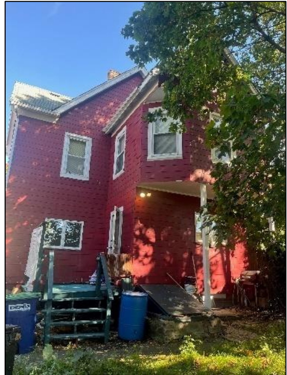
Right: Right Elevation